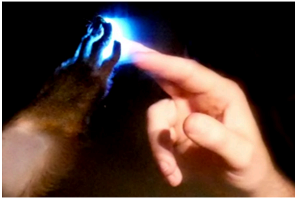
Macaque and human decided on the same target and received the highest possible reward for this coordination.